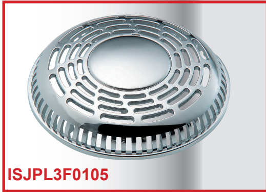
STANDARD SUCTION COVER PLATE