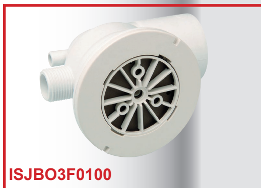
3F SUCTION BODY + MEMBRANE