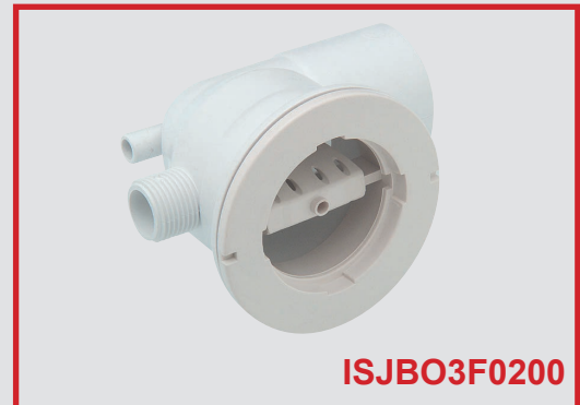
3F SUCTION BODY